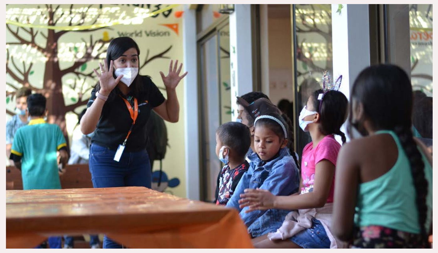
A staff member gather children to give them meals and snacks in a refugee center in Arica, Chile.

traditions between the host society and refugees further undermine communal harmony. In Moldova, for linguistic, cultural and logistical reasons, authorities decided to separate Roma refugees from ethnic Ukrainians to prevent tensions between the two ethnicities and better provide for their specific needs.<sup>32</sup> This situation is causing the Roma to feel discriminated against and may lead to a growth in anger and confusion across host and refugee communities, and even between refugee populations.