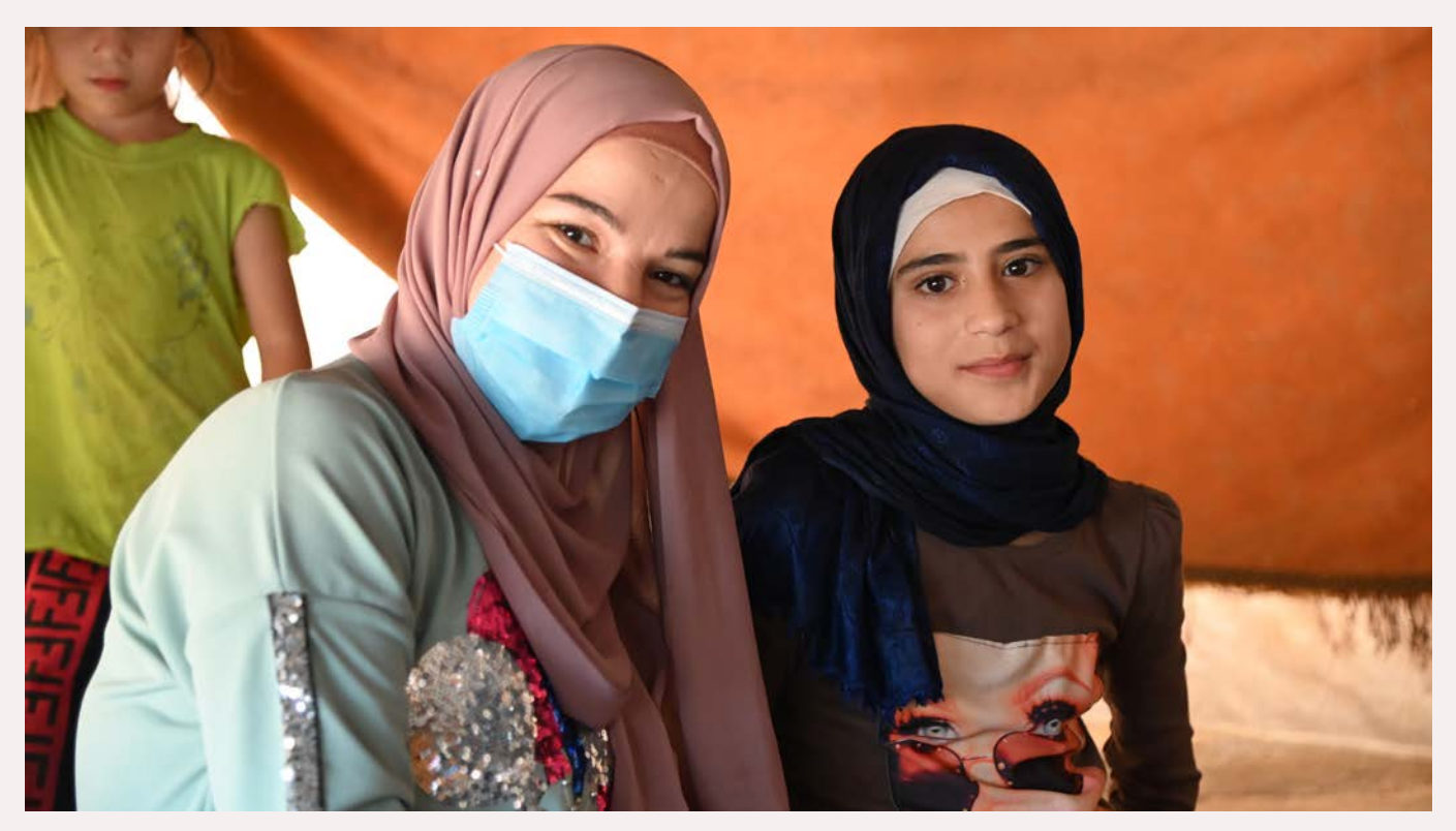
A Syrian refugee in Lebanon with her mother.

ensure livelihood opportunities were available for host and refugee communities, and local and national level advocacy for more inclusive programmes towards refugees to help ease the tensions. However, the impact has not been substantial, and tensions remain. World Vision has helped address tensions through a wide variety of interventions, such as: