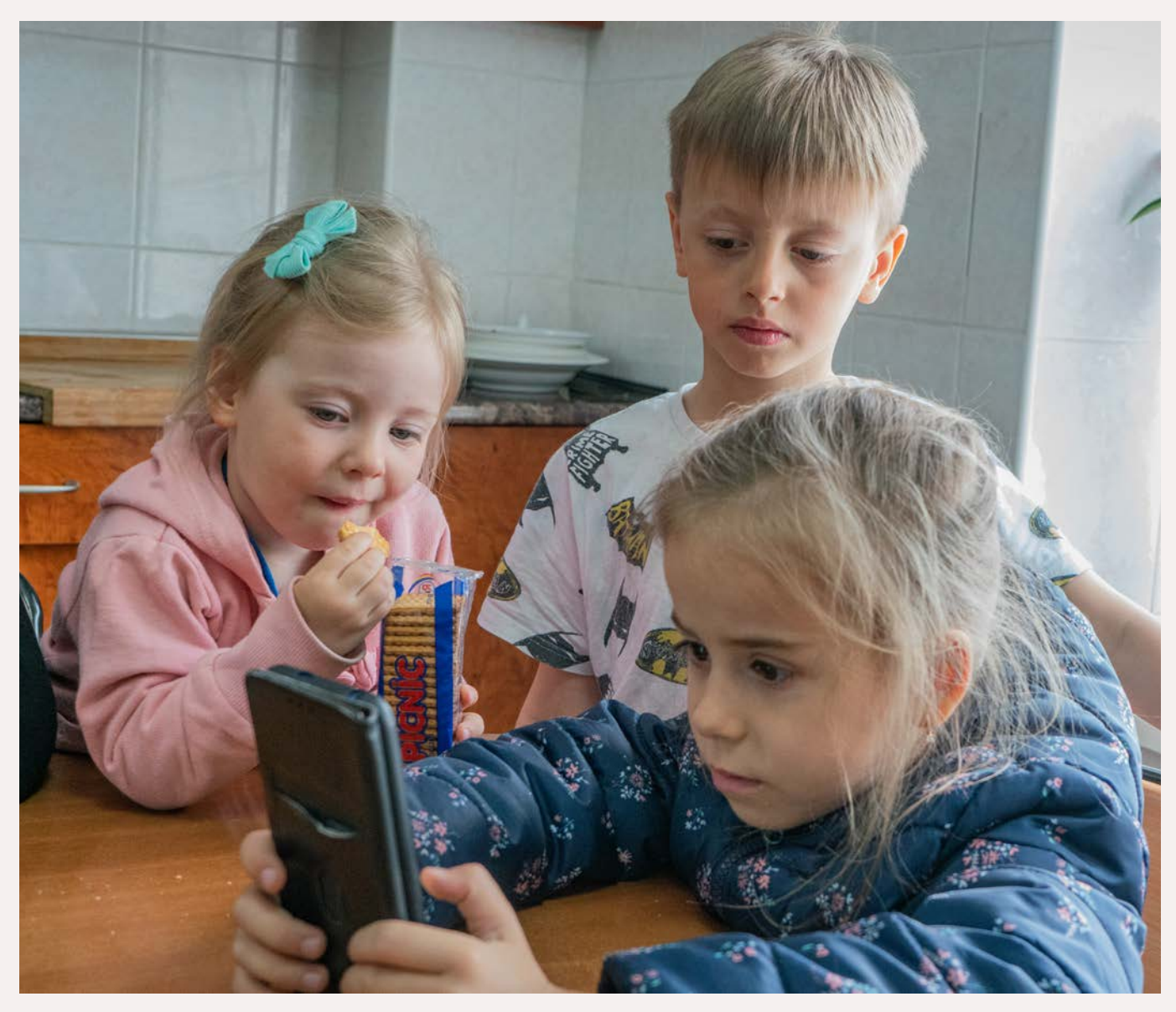
Children live with their mother in the Zimbu Football Club in Chisinau, Moldova. The family left Odessa as soon as the bombing started.

A very small percentage of Ukrainian refugee children have been enrolled in Moldovan schools, often because of uncertainty over the length of their stay, and the availability of continuing their Ukrainian schooling online.<sup>70</sup> However, if the conflict continues, it is possible that a surge in school enrolments in the autumn may become a flash point for tensions to develop. On the other hand, if children from Ukraine do not enrol in Moldovan schools, that is a potential point of positive integration missed.