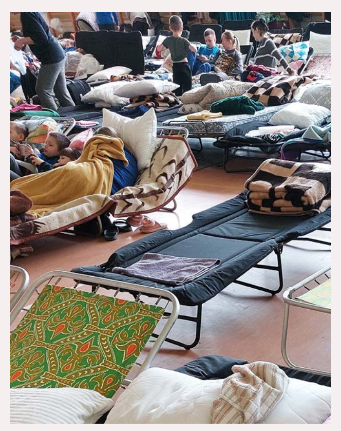
A refugee shelter in Poland.

Like Romania and Moldova, many who cross the border into Poland do not stay in Poland but move on to other locations within the EU-Schengen area. According to the Polish government, as of the end of April, of the near four million refugees who crossed into Poland from Ukraine, over 1.2 million have registered for Temporary Protection allowing them to seek employment in Poland.<sup>82</sup> A considerable number of people are waiting close to the border in order to cross back into Ukraine as soon as they feel it is safe to do so. Since the conflict