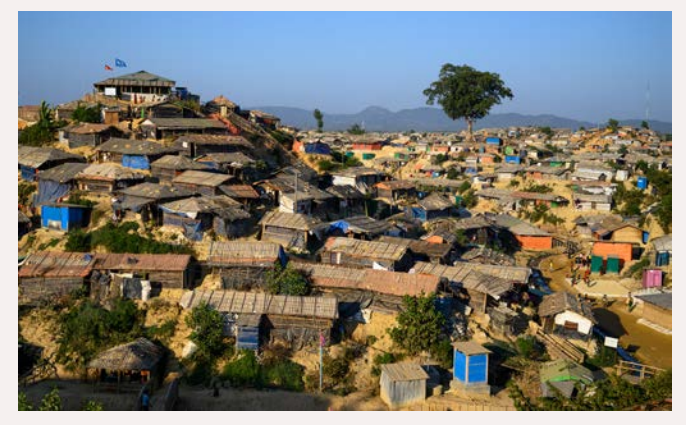
Rohingya refugee camp in Bangladesh.

Bangladesh currently hosts around 927,000 stateless Rohingya refugees, around 620,000 of whom live in the world's largest and most densely populated refugee camp, Kutupalong.<sup>62</sup> About half of the refugees are children. With unmet humanitarian needs of both refugee and host communities ramping up tensions, more needs to be done immediately to address the growing resentment.