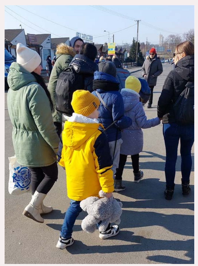
Refugees arriving to Poland.

Poland and Hungary, for example, are EU members and thus part of the Schengen area, so anyone entering these countries – thanks to the EU's Temporary Protection Directive – can go on to any other Schengen country, as well as some non-Schengen countries like Romania. This is not an option available to refugees from other contexts, where refugees are often concentrated in neighbouring countries and unable to transit further. Ukrainians have more displacement destination options compared to other refugee crises, which takes the pressure off neighbouring countries.